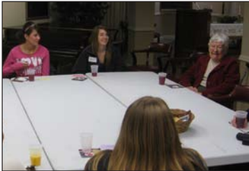
Sharing laughter at Wesley Acres

In observance of Martin Luther King, Jr. Day, YLI students came together for the Diversity class. The day began exploring what the topic of diversity encompasses, and students were challenged to think about the issue as a larger subject than race or ethnicity. First stop on the