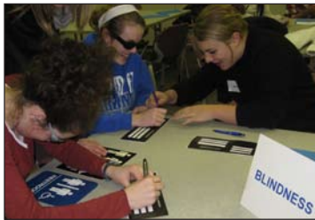
Simulating blindness with CICIL